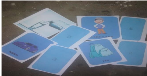
Figure 2.1 Flash card